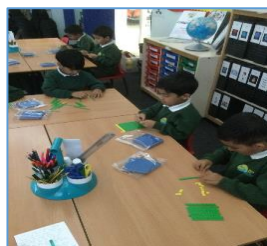
The children using dienes to find a two-digit number.