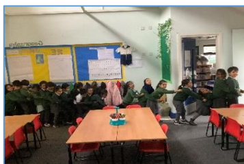
Year 1 role playing a part of the story where they attempt to pull the turnip out.

"In computing we get to learn how to use the computer and learn how to be safe on the internet" - Maya