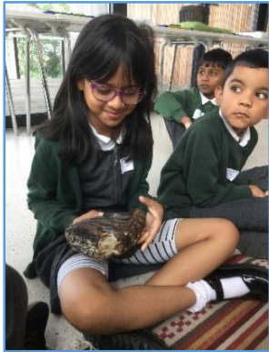
Year 3 Trip to Horniman Museum